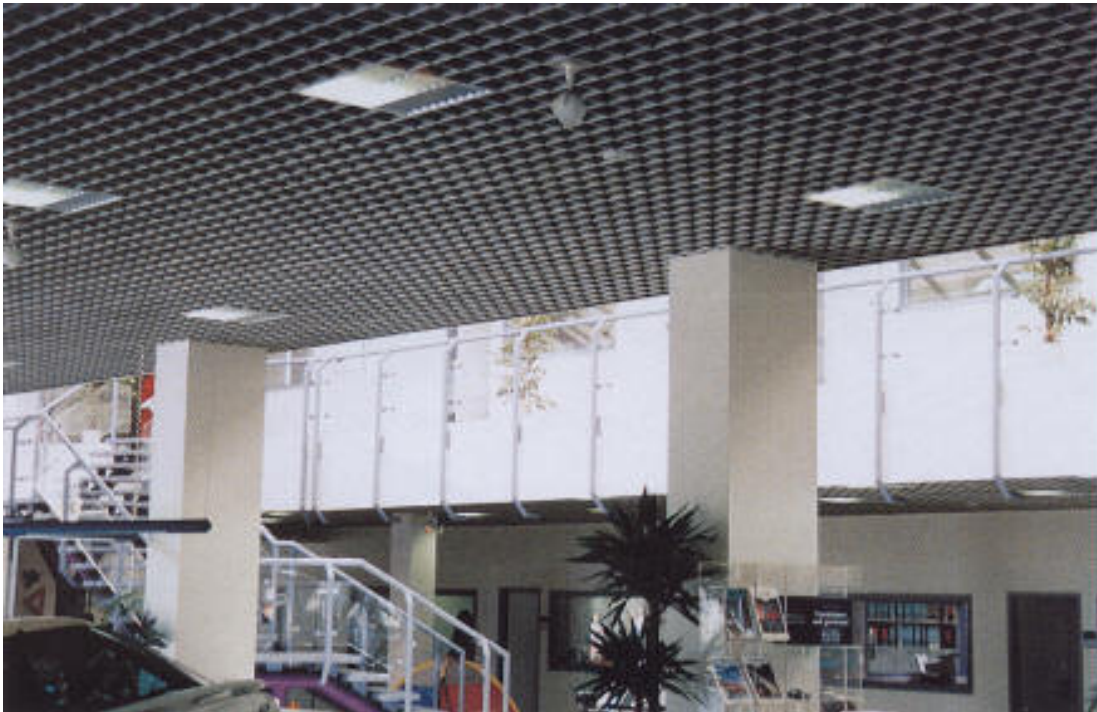
SACHSENGARAGE, DRESDEN, GERMANY